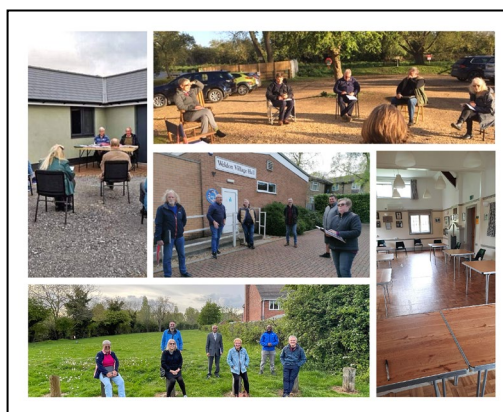
Council meetings were a bit different in 2020!